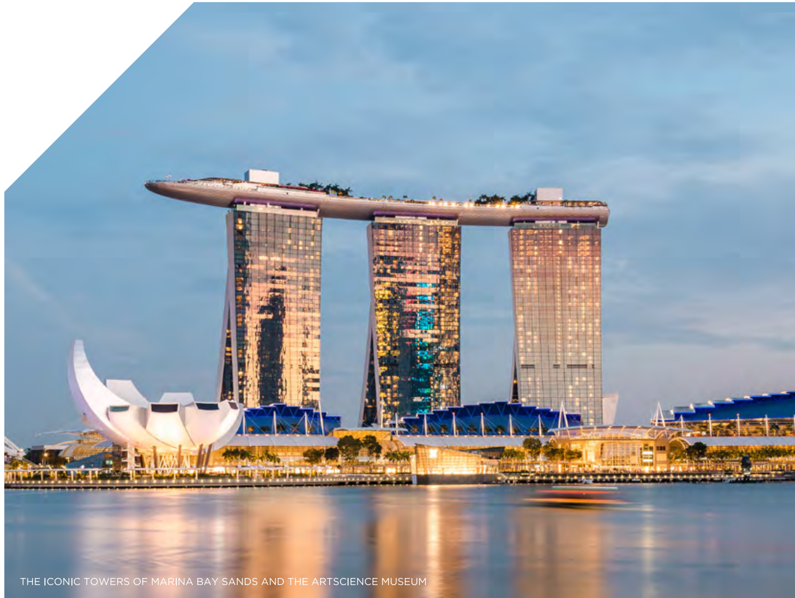
THE ICONIC TOWERS OF MARINA BAY SANDS AND THE ARTSCIENCE MUSEUM