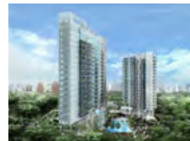
THE VERMONT ON CAIRNHILL