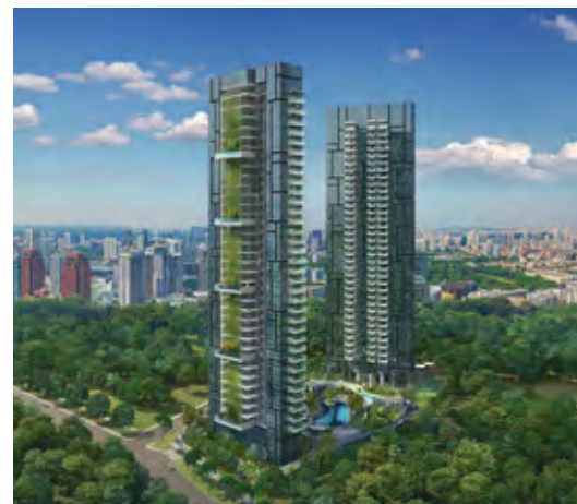
8 ST THOMAS