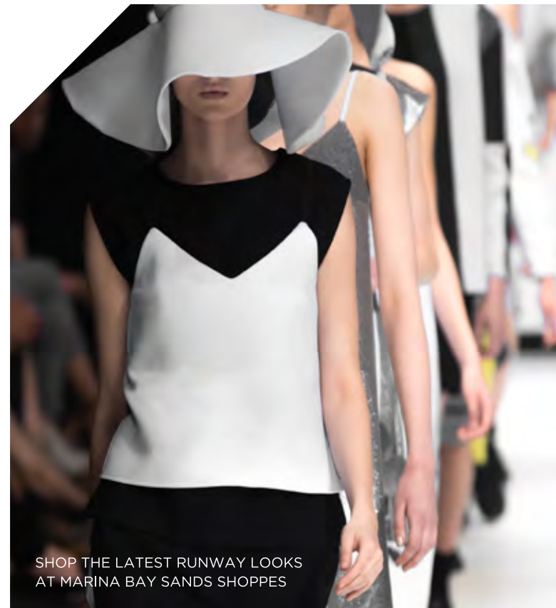
SHOP THE LATEST RUNWAY LOOKS AT MARINA BAY SANDS SHOPPES