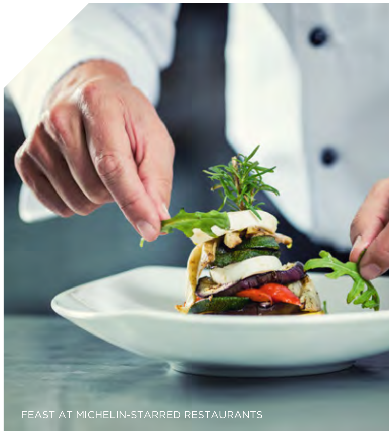
FEAST AT MICHELIN-STARRED RESTAURANTS