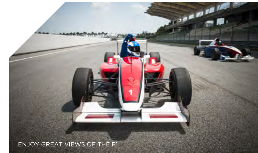
ENJOY GREAT VIEWS OF THE F1