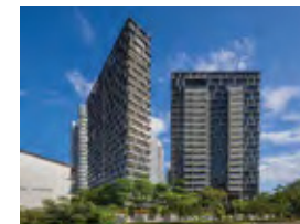
FRASER RESIDENCE ORCHARD SINGAPORE